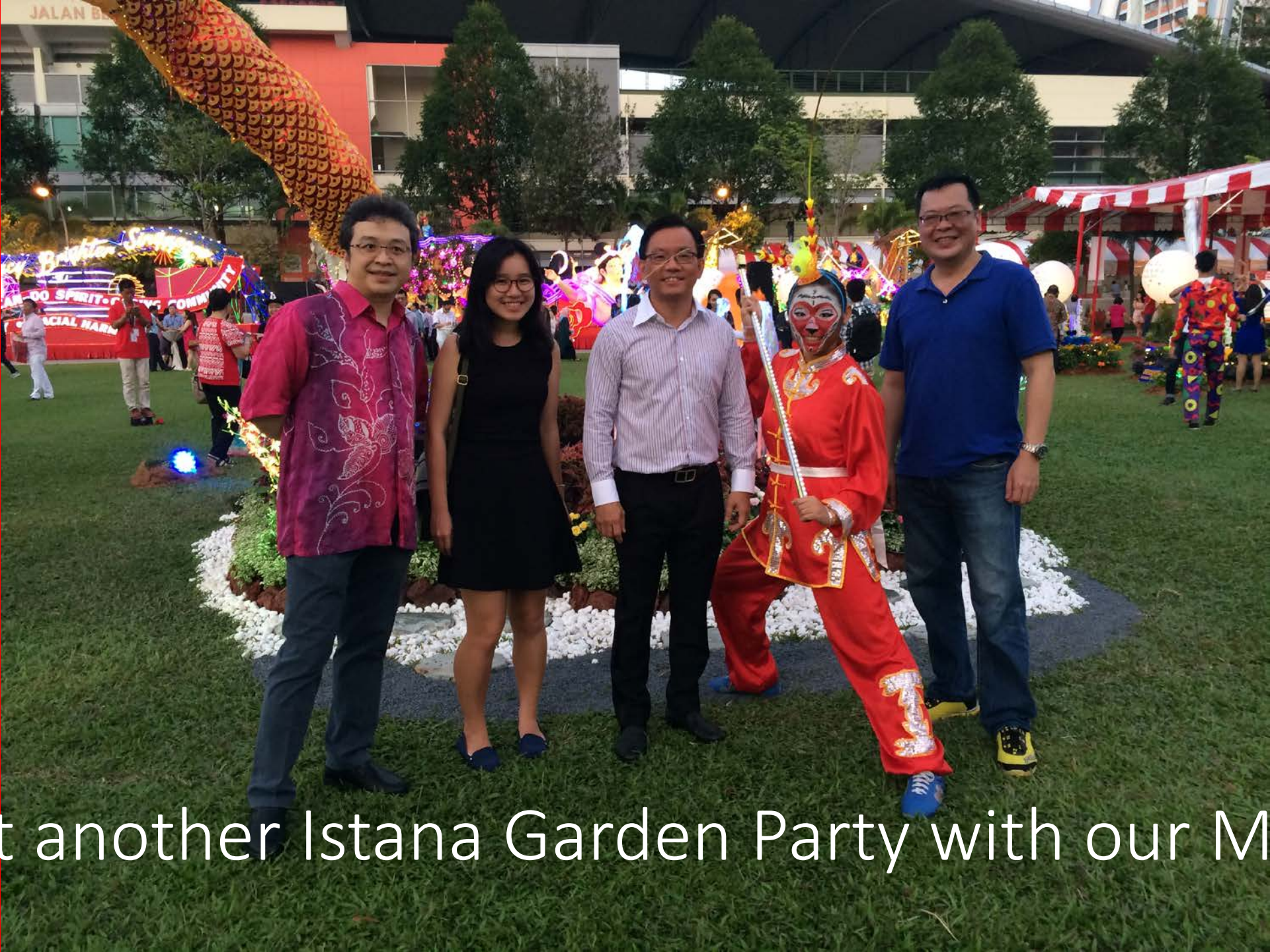
At another Istana Garden Party with our MP