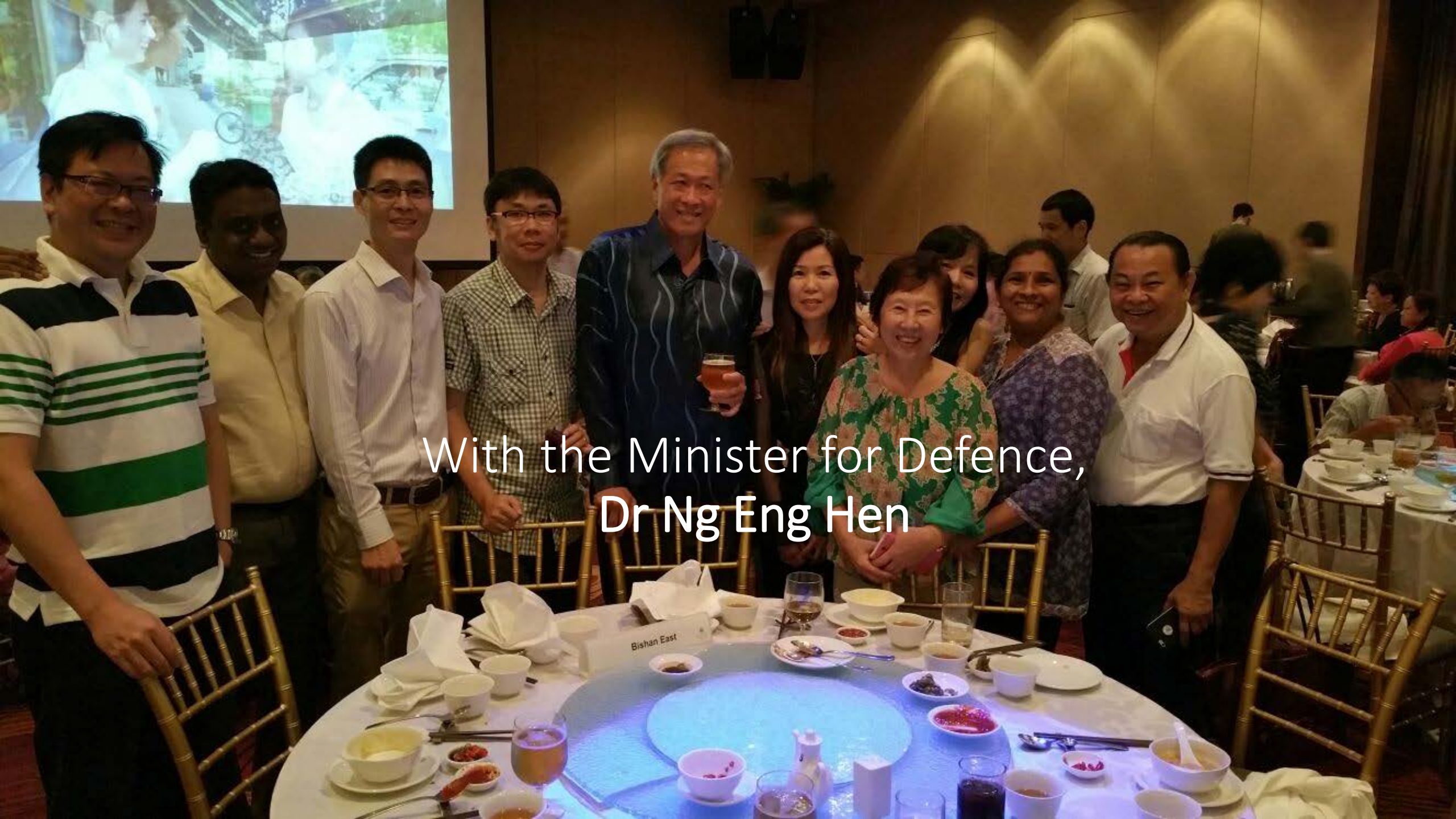
With the Minister for Defence, Dr Ng Eng Hen